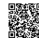
Website of medical library